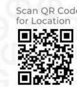
Scan QR Code for Location

Site Add.: Plot No-6, Swej Farm Circle, Sodala, Jaipur