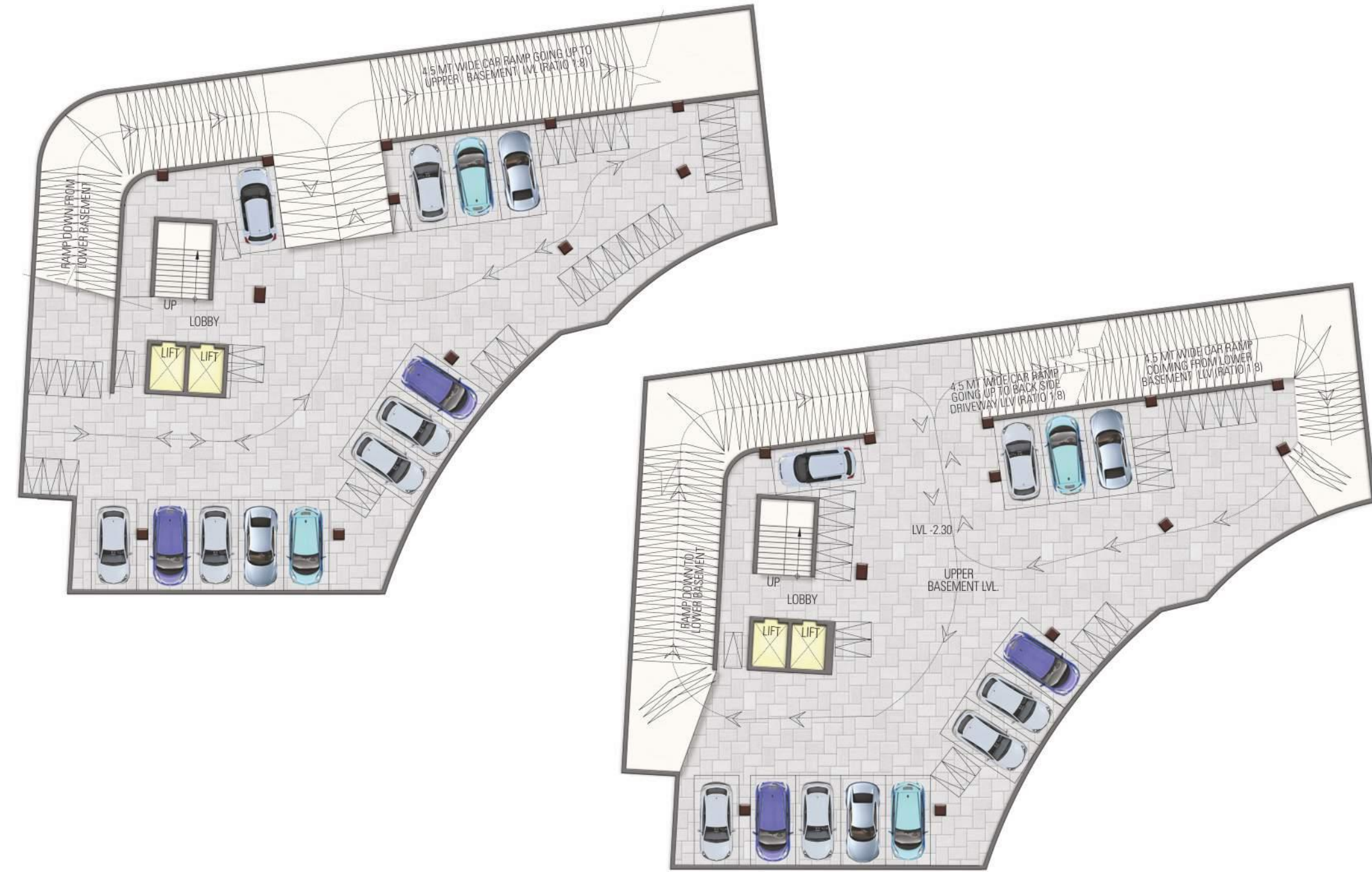
Lower Basement Floor Plan